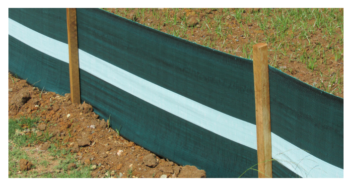
Typical sediment fence.