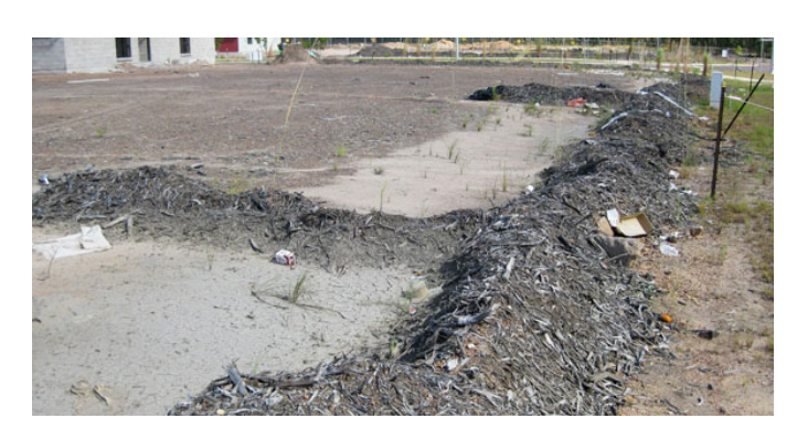
Mulch berm with upslope 'return' being used on small, flat house lots.

All sediment barriers need to be regularly checked and properly maintained in full working order to remain effective. If they are moved, damaged, become compacted or fill up with sediment then you need to reinstate them ready for the next rain event.