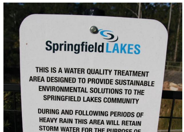
Some new urban areas in South East Queensland have been built on water sensitive urban design principles.