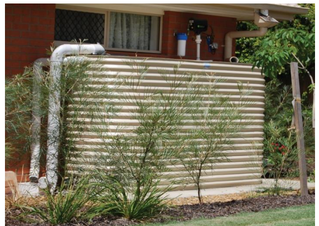
Rainwater tanks can provide water for toilets, gardens, hot water systems and laundry.

Wetlands are often referred to as the 'kidneys' of our river systems. Constructed wetlands (shown above) and 'raingardens' can be designed in urban areas to capture and filter stormwater whilst also supporting biodiversity values and boosting scenic amenity.