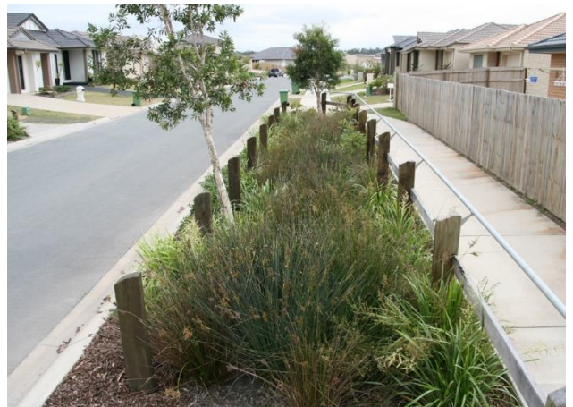
WSUD makes use of plants to improve the quality of urban stormwater runoff.