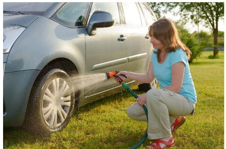
Wash your car on the grass so the soapy water doesn't end up in our creeks and rivers.