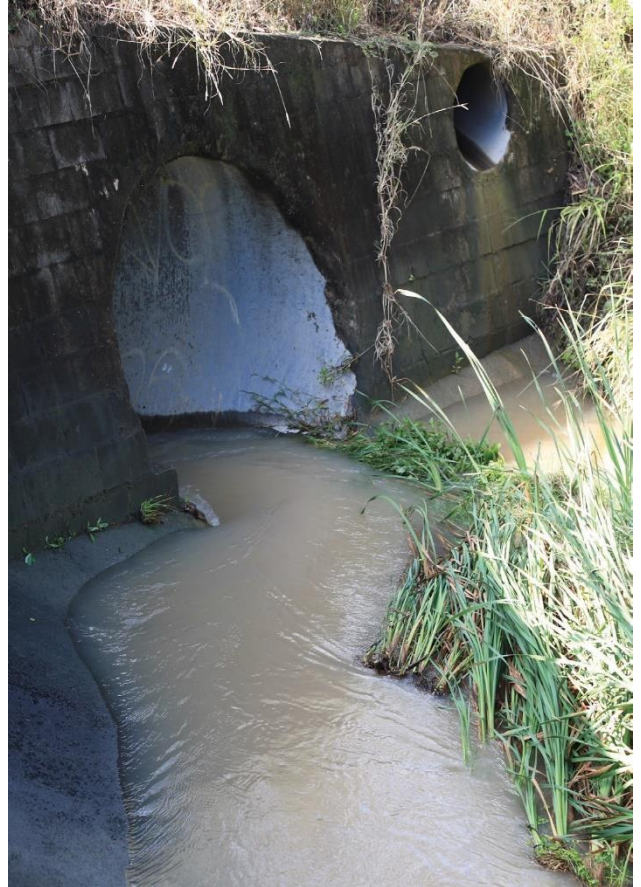
Stormwater drains can deliver pollutants into our waterways.

Poorly treated wastewater and sewage can contain high levels of dissolved nutrients, which have the potential to promote the growth of algae. The effects of these pollutants may also act to reduce dissolved oxygen in the water, which is essential for most aquatic life.