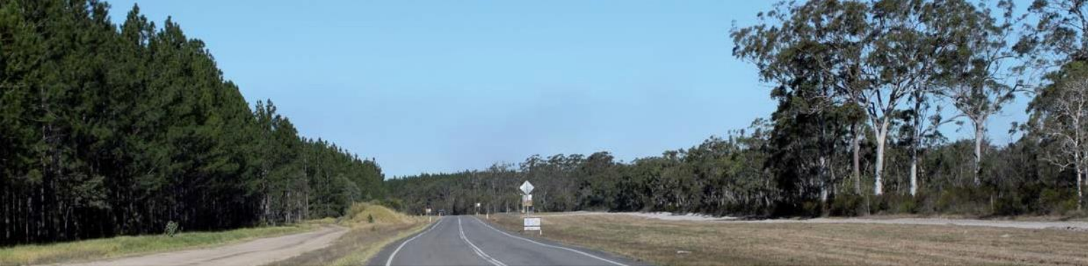
The wallum country of SEQ, comprising a number of REs, including RE 12.3.14, used to cover much of the low lying coastal plains between Brisbane and Gympie. However, clearing for urban settlement and conversion of wallum into commercial pine plantations has resulted in a mosaic of small remnant patches with distinct boundaries.