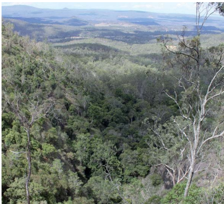
The occurrence of RE 12.8.21 often provides a cool shady patch in otherwise dry landscapes, such as this rainforest gorge (right) surrounded by dry Eucalypt forest.

The threatened ground-dwelling Black-breasted Button Quail is a sedentary bird that lives in semi-evergreen vine thicket patches across SEQ.