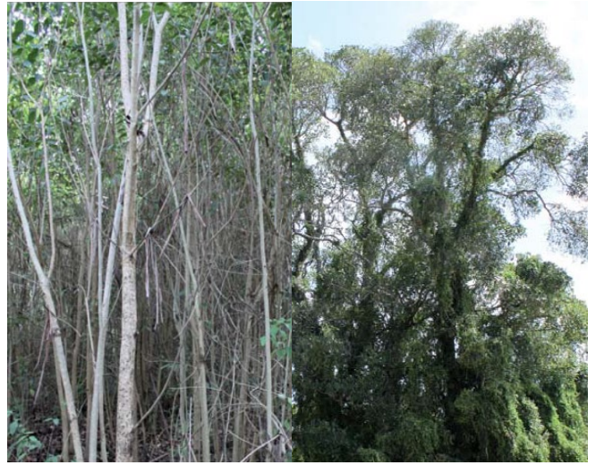
Privet (left) is an invasive weed of RE 12.8.21, forming dense monocultures that exclude native species and prevent regrowth. Cat's Claw Creeper (right) is a huge threat to semi-evergreen vine thickets as it can smother and kill mature trees.

Softwood scrub species tend to be slow growing and the survivors in paddocks may be very old. Their growth may now be restricted by competition from pasture grasses and Lantana ( Lantana camara ), browsing and trampling by cattle and macropods, and even the occasional fire. This often gives them a stunted, clumped appearance. However, it demonstrates a capacity for resilience amongst the species that can be used to good effect in restoration and rehabilitation