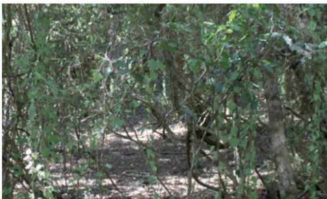
Madeira Vine and Dutchman's Pipe vines will invade the shady interior of vine thickets.

The introduced pasture grass Green Panic ( Megathyrsus maximus ) is a prolific seed regenerator which establishes in semi-shade along the margins of semi-evergreen vine thickets. It becomes highly flammable when dry and increases the risk of damage from fire. Fire normally burns to the edge of vine thicket patches under moist or cool conditions. However, under dry conditions fires will burn some distance into softwood scrub and can creep through the leaf litter on the forest floor. While some edge species will sucker, fire usually causes a great deal of stem death and damage. Fire also promotes weed invasion by Lantana, Green Panic, introduced members of the passionfruit family ( Passiflora spp. ) and other weedy grasses, vines and herbs. Softwood scrubs have limited value as fodder for cattle; however, cattle will use patches for camps resulting in trampling and spread of weeds. Coral Berry ( Rivina humilis ) often forms dense clumps in areas used by cattle.