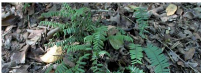
Dwarf Sickle Fern ( Pellaea nana )