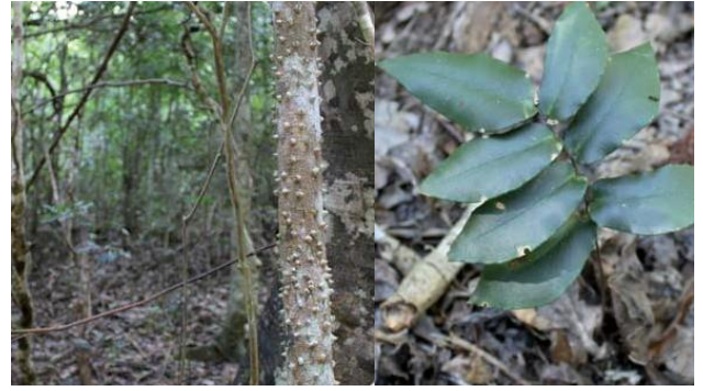
Despite the tough, hardy and prickly nature of many dry vine forest plants, most species are fire intolerant and will die in a fire. Shown here are Pine Mountain Coral Tree ( Erythrina numerosa ), left foreground, and the Large-leaved Sickle Fern ( Pellaea paradoxa ), right.

Patches of vine forest that have been severely damaged by logging, storms or fire are prone to the formation of dense Lantana thickets that may persist for many decades.