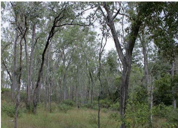
Dry vine forests, such as RE 12.9-10.16, are very susceptible to damage from fire, particularly on patch edges (shown on the right side in the photo above). Any controlled burns in adjacent woodlands should consider mechanisms to exclude or prevent fire from going into the vine forest.

Where rainforest patches abut cleared grazing pasture, the highly invasive introduced pasture species Green Panic ( Megathyrsus maximus ) plays a similar role in increasing fire risk. The species tolerates semi-shaded conditions under a broken tree canopy and like Lantana, becomes highly flammable when dry.