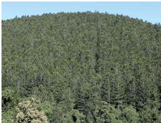
Much of the original extent of RE 12.9-10.16 has been cleared and replaced with Hoop Pine plantations.

Early plantings used maize and papaws in the initial stages to provide shelter for the Hoop Pine seedlings and to reduce the growth of weeds. The fertile soils supporting Hoop Pine vine forests were also cleared for dairying and fruit growing. However, many patches survived on lands set aside as state forest and on slopes that were too steep or rocky to clear