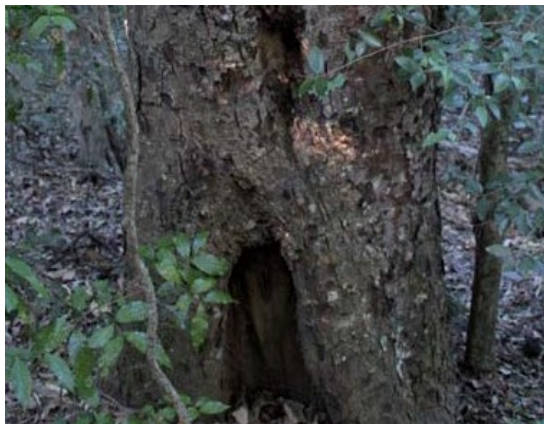
Crows Ash (Flindersia australis) was one of the sought after rainforest timber species that grow in RE 12.11.11. The highly durable timber was used for dancefloors, butchers blocks, decking, railway sleepers, coach building and furniture. Large specimens that remain in todays landscape often have features that may compromise the timber quality, which meant they were left by early timber collectors.

The diversity of vegetative life forms present play a prominent role in intercepting, generating, storing and recycling energy, carbon, nutrients and pollutants, protecting soil from rain-wash and erosion and filtering and trapping sediments.