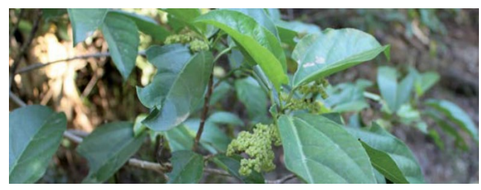
Shiny-leaved Stinging Tree (Dendrocnide photinophylla)