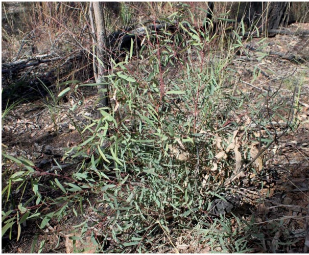
Established Narrow-leaved Ironbark ( Eucalyptus crebra ) have a strong capacity to re-shoot from lignotubers when damaged after fire or clearing.