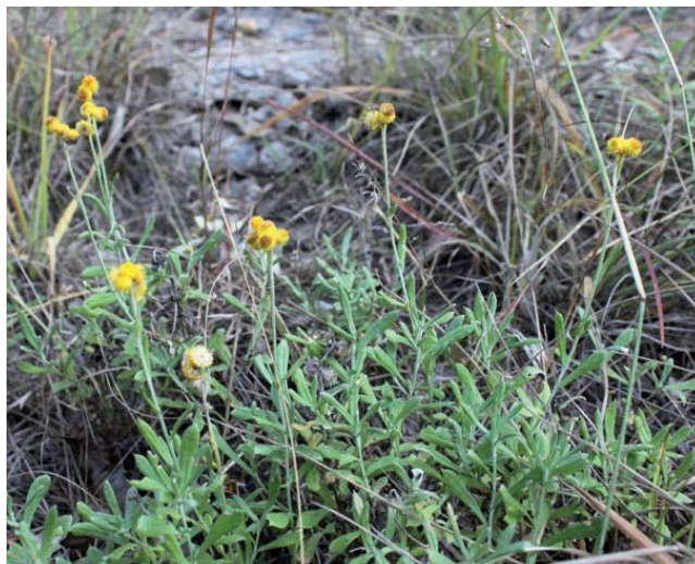
A healthy RE 12.9-10.7 understory will consist of a diverse range of grasses, and other twiners and forbs, such as Yellow Buttons ( Chrysocephalum apiculatum ).

Burning based upon spot ignition should aim to produce fine-scale mosaics of unburnt areas which assist fauna to survive by providing ongoing food and shelter. Ironbarks are susceptible to catching alight near their base and this can result in attrition of older hollow trees which fall as a consequence of the fire damage.