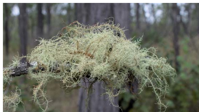
Foliose lichen in Ironbark woodland