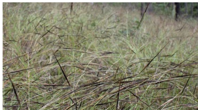
Black Spear Grass

Designed and produced Healthy Land & Water, a community based, not-for-profit organisation that works to protect and restore the natural resources of South East Queensland.