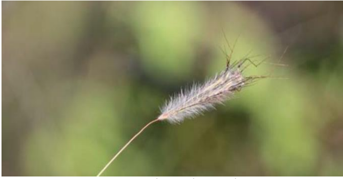
Queensland Blue Grass ( Dicanthium sericeum )