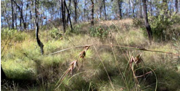
Kangaroo Grass ( Themeda triandra )