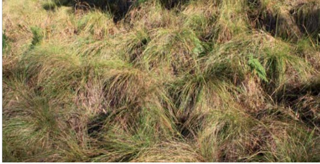
Tussock Grass ( Poa labillardieri )