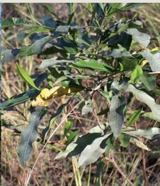
Hopbush ( Dodonaea viscosa )