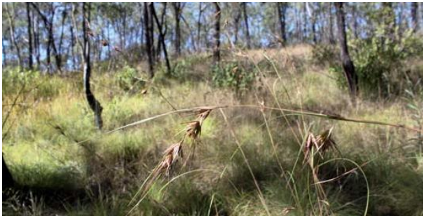
Kangaroo Grass ( Themeda triandra )