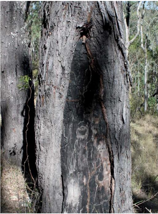
Ironbark trees were used as blaze and survey markers because of their resilient timber and the ability to hold a mark over a long period.