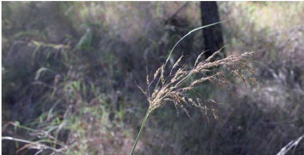
Scented Top ( Capillipedium spicigerum )