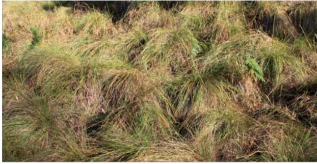
Tussock Grass ( Poa labillardieri )