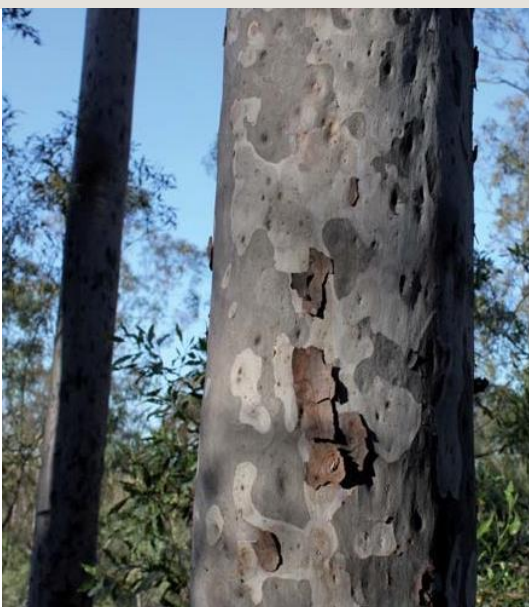
Spotted Gum ( Corymbia citriodora )