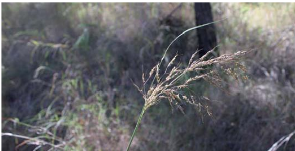
Scented Top ( Capillipedium spicigerum )