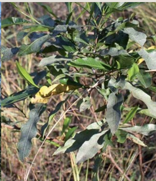
Hopbush ( Dodonaea viscosa )