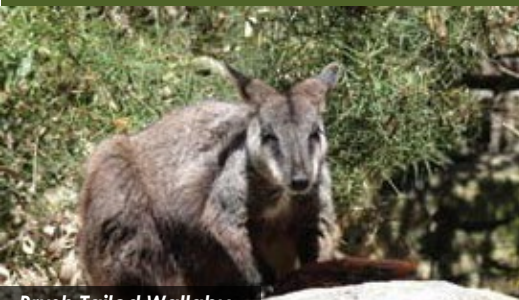
Brush Tailed Wallaby