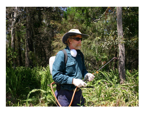
Make sure you use the proper safety equipment when spraying with herbicide.

Step 3: Cut vine stems again close to the ground and immediately (within 10 seconds) apply herbicide to the lower stump.