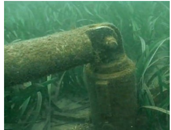
An environmentally friendly mooring with seagrass growth around the mooring.