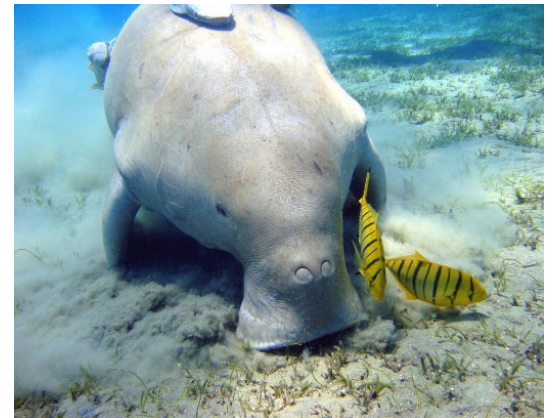
Moreton Bay's seagrass beds are vital for maintaining a healthy dugong population.

In Moreton Bay, there are seven species of seagrass that form important habitat for many marine species and are a key food source for dugongs and green turtles. Seagrass beds face a number of threats, including sediment runoff, algal blooms, and damage from block and tackle moorings.