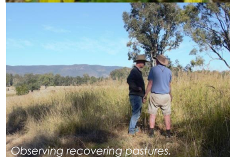
Observing recovering pastures.