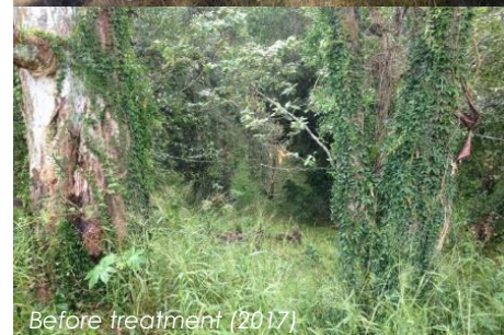
Before treatment (2017)