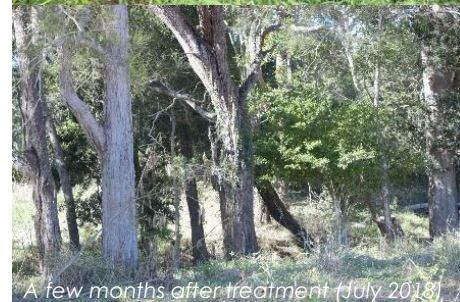
A few months after treatment (July 2018)