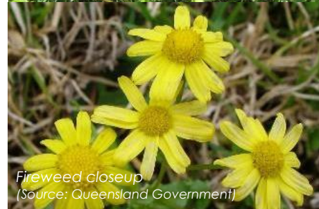
Fireweed closeup