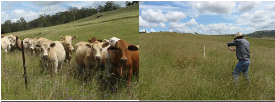
Image: Resting pastures and monitoring species composition can help you to better manage your grazing for production and environmental outcomes.