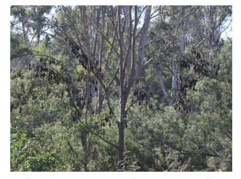
Flying foxes often colonise the vegetation along waterways of RE 12.3.7, taking advantage of the suitability of the vegetation structure, and the cooling effect of the waters below.