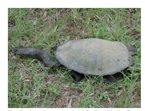
The Eastern Long-necked Turtle (Chelodina longicollis) can often be seen basking on fallen vegetation along, and within the stream edges of RE 12.3.7.

RE 12.3.7 is an important component of the modern SEQ landscape. The vegetation along watercourses was often retained during clearing of the surrounding lands, leaving corridors of green to provide crucial linkages and connectivity across the landscape. At the landscape scale, RE 12.3.7 provides connectivity between uplands and lowlands and between scattered remnants of vegetation along floodplains. This is of special importance for mobile species dependent on cover and shelter.