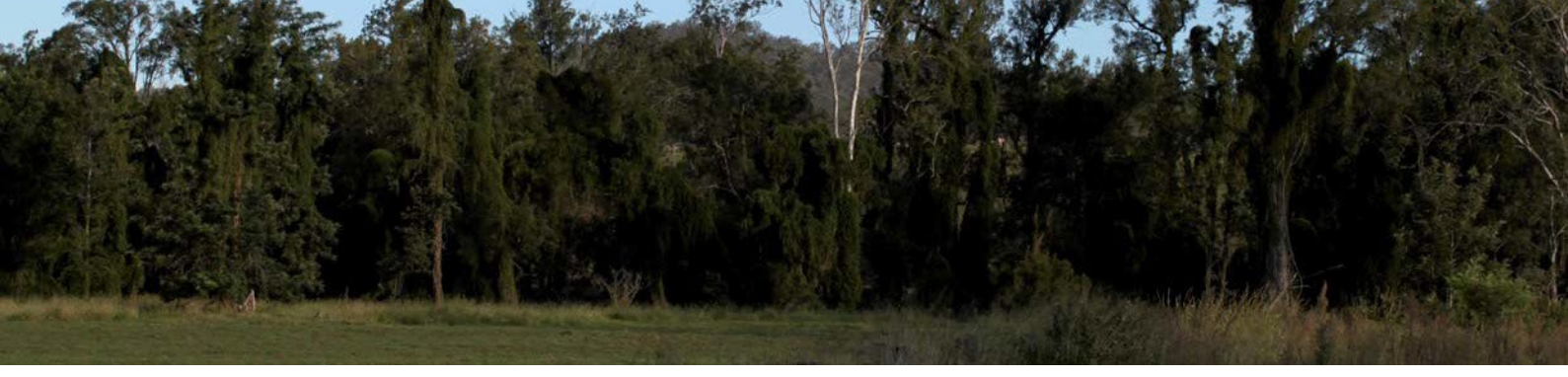
Cats Claw Creeper (Dolichandra unguis-cati) is a major weed infesting RE 12.3.7 in SEQ, smothering the canopy trees and destroying the structure of this ecosystem.