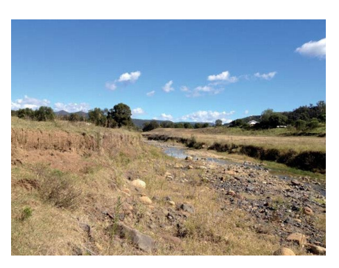
An example of a watercourse where the removal of vegetation has contributing to bank instability, soil erosion and increased sediment loads in the creek.