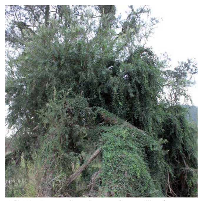
Cat's Claw Creeper shown here growing over Weeping Bottlebrush (Melaleuca viminalis) intertwinned with flood debris makes access for weed control difficult.

The control and ongoing exclusion of weeds from RE 12.3.7 is resource intensive. There has been a huge response by community groups and landholders to reversing the decline in condition through weed control, including removal of woody species, replanting and fencing of selected riparian habitat.